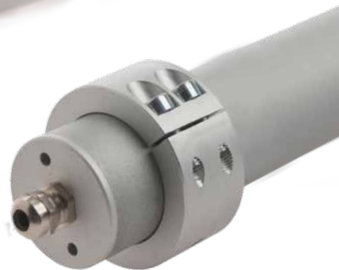
Actuator with slide ring