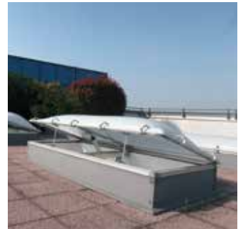
SMOKE EXHAUST SYSTEM